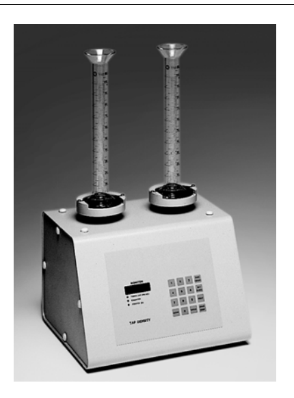
FIGURE 1. Dual-platform Tapped Density Tester

Select the tapping program on the basis of time or the number of taps via the front panel keypad. An optional Report Center Printer provides hard-copy documentation of instrument operation and allows you to have the instrument handle your tapped density calculations.